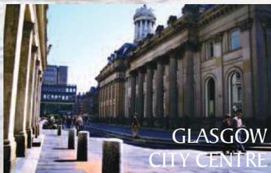
GLASGOW CITY CENTRE

Then motorway, via 'Falkirk Wheel' requested, to: